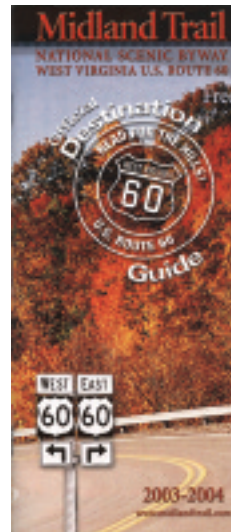
2003-2004 Guide Cover