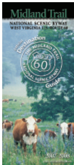
2007-2008 Guide Cover