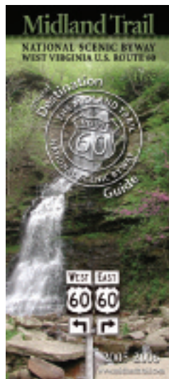
2005-2006 Guide Cover