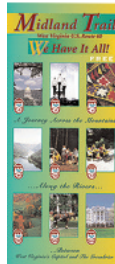
2001-2002 Guide Cover