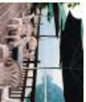
Glen Ferris Inn

Glen Ferris With a tradition of hospitality since 1839, the Glen Ferris Inn provides a restful stay in fine style for visitors along the Midland Trail.