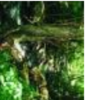
Lookout / Winona

Lookout At Lookout, turn off to Winona and take an adventurous side trip through some of WV's most pristine forest. East of Hico, is the highest point along the Trail, Big Sewell Mountain (3,170 feet).