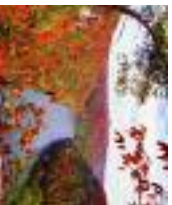
Hawks Nest State Park

Hawks Nest Hawks Nest State Park sprawls over the mountain top at Ansted and down to the bottom of the New River Gorge. Amenities include Hawks Nest Golf Course, picnic area and overlook, tram and jet boat rides at the base.