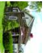
The Toll House

Barboursville Barboursville offers the perfect blend of old and new from the Huntington Mall to the Historic Walking Tour of 30 buildings including the Toll House (1837), a log cabin toll house used by ferrymen to collect river tolls. Main Street Park provides a pleasant afternoon respite.