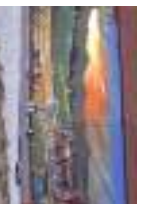
City of Hurricane Murals

Hurricane The Main Street Specialty Shops found in restored homes, such as Colonial House (1885) make shopping an adventure. Tour History Row and see why Hurricane is known as the "City of Murals." Take a break with high tea at the Root Cellar. For the kids, Waves of Fun Water Park and Putnam County Park Pool are cool treats.