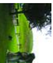
Adena Indian Mound

South Charleston For interactive fun, take the family to Rock Lake Putt-Putt Golf and Games, featuring three 18-hole courses, go-cart racing and Laser Storm, then cool off at South Charleston Memorial Ice Arena. Visit the downtown area to view the Adena Indian Mound, the second largest in the state.