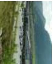
Quincy Shopping Center

Quincy Quincy Shopping Center, a convenient stop for all your needs, occupies an area that was once a country road and is the oldest tract of continuously farmed land along the Midland Trail.