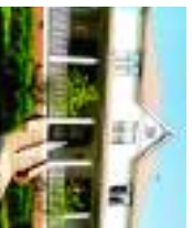
WVSU East Hall

Institute Sited on land surveyed by George Washington, the historically black West Virginia State University offers tours of its grounds including Historic East Hall circa 1893, which has known many distinguished visitors.