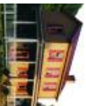
Hale House Circa 1838

Malden Malden is the boyhood home of Booker T. Washington and the world-renowned Cabin Creek Quilt Cooperative. While visiting the Booker T. Washington Log Cabin, stop next door at West Virginia's oldest Afro-American Baptist church, African Zion Baptist Church (1872).