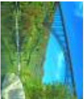
New River Gorge Bridge

Hico Hico, the crossroads of Rt. 60 and Rt. 19 provides a gateway to the best whitewater East of the Mississippi. Take a trip across North America's longest arch span bridge.