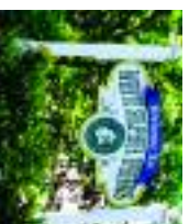
White Sulphur Springs

White Sulphur Springs Since the 18th Century, travelers have flocked to the area to experience the healing powers of the sulphur springs. White Sulphur Springs is home to the luxurious Greenbrier Resort, historic re-enactment of the 1862 Battle of Dry Creek, Allegheny Trail and the Federal Fish Hatchery. For travel information call