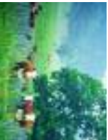
Field of Lavender

Rainelle/Rupert Meadow River Park/Greenbrier Youth Camp is located between Rainelle and Rupert and is open for public camping. In Rainelle, celebrate the history of the lumber and coal industry at the Meadow River Festival held the first weekend in August.