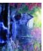
Babcock State Park

Clifftop/Babcock State Park At the intersection of Rt. 60 and Rt. 41, you'll find Babcock State Park home of the frequently photographed Glade Creek Grist Mill. Also along Rt. 41 at Clifftop is Camp Washington Carver, the state's Mountain Cultural Arts Center.