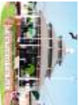
Old Central City

Huntington With its downtown situated on the banks of the Ohio River, Huntington is a beautifully designed city. Huntington boasts a variety of activities and attractions featuring antique shopping and a farmer's market at the 14th Street W. - Old Central City, the Huntington Museum of Art, Ritter Park, Camden Park, and Heritage Farm Museum and Village.