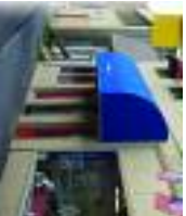
Blue Smoke Salsa

Ansted The town of Ansted is where travelers come to seek out the "Grand Canyon of the East," the New River Gorge. At the western edge of Ansted lies Hawks Nest State Park with spectacular views and a tram to the bottom of the Gorge. Other points of interest include the Contentment Museum Complex, the African American Heritage Family-Tree Museum and Blue Smoke Salsa.